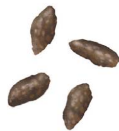
Rattus norvegicus droppings