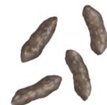
Rattus rattus droppings